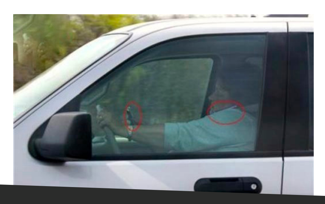
Don't be the laughing stock of all their friends and all your neighbors!